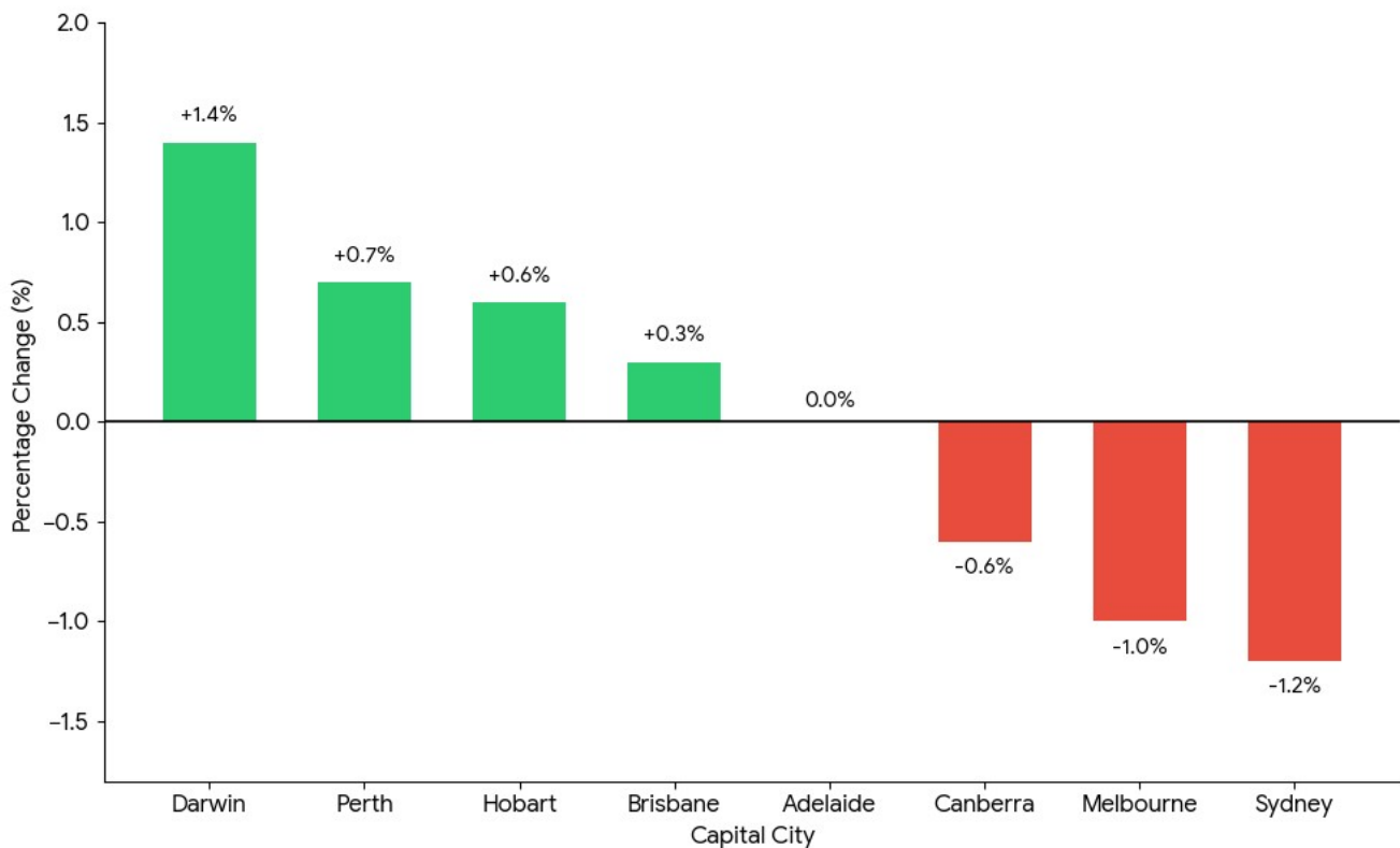
Capital City Monthly Change in Dwelling Values (June 2026)

The downward movement in national home values was primarily driven by substantial corrections in the largest capital cities. Across the combined capital cities, values dropped by 0.6% in June alone, culminating in a 1.3% loss over the June quarter.